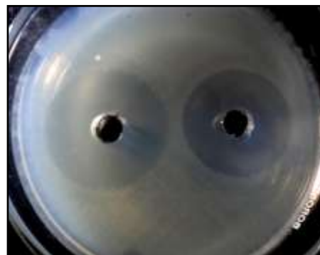
Fig-2: Zone of inhibition of Kanamycin against S. epidermidis .