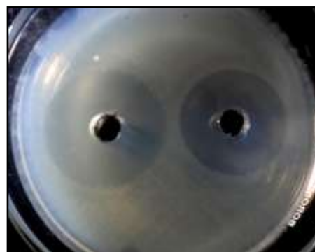
Fig-2: Zone of inhibition of Kanamycin against S. epidermidis .