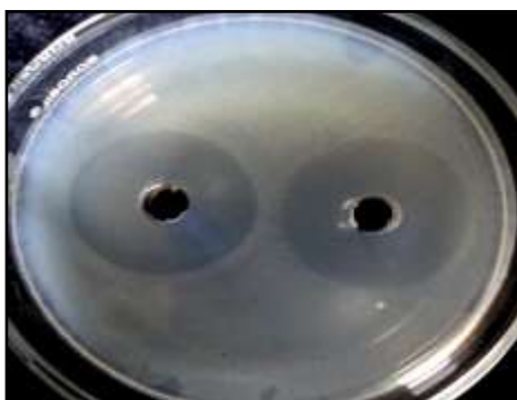
Fig-1: Zone of inhibition of Amikacin against S. aureus .